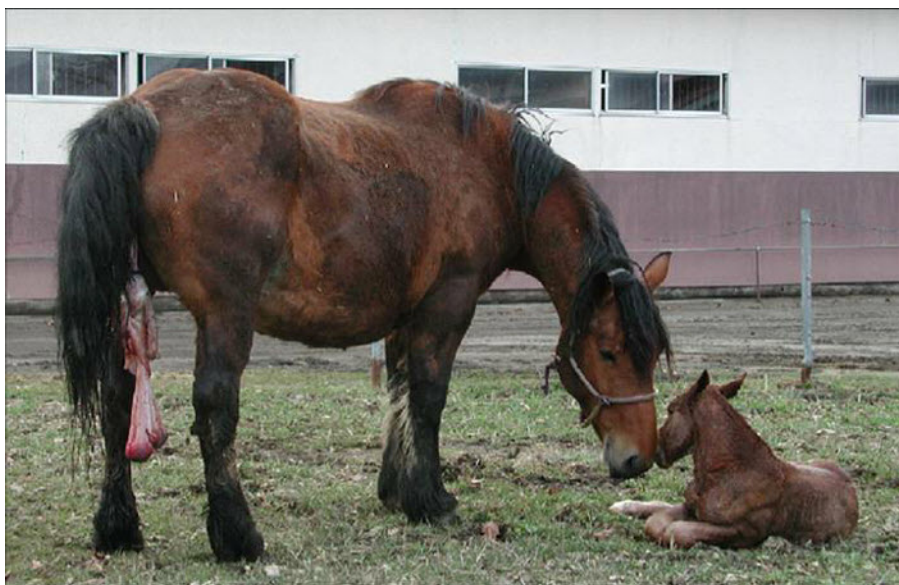
Retention of the foetal membranes is a particular problem of draft breeds.

All four mares expelled the placenta after between 1 and 3 injections.