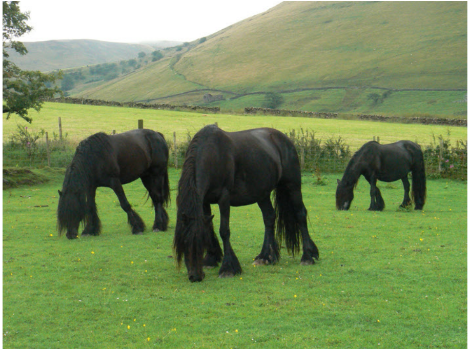
Fell pony owners can now avoid breeding affected foals by testing breeding stock. Affected foals (below) will not survive.