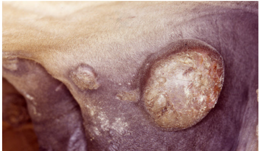
An estimated 6-7% of horses in the UK are affected with sarcoids.