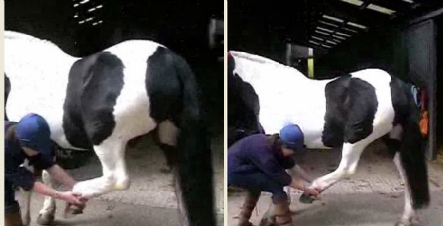
Stretching three times a week produced some increase in range of movement.

The research team used video analysis to measure stride length and range of motion of the limb joints. All horses were trotted up in hand at a constant speed by the same experienced handler. Measurements were taken initially and at two-week intervals throughout the eight weeks of the study.